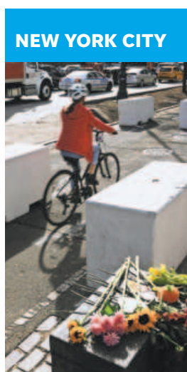
NEW YORK CITY Eight people died when a truck drove onto a bike path in 2017.