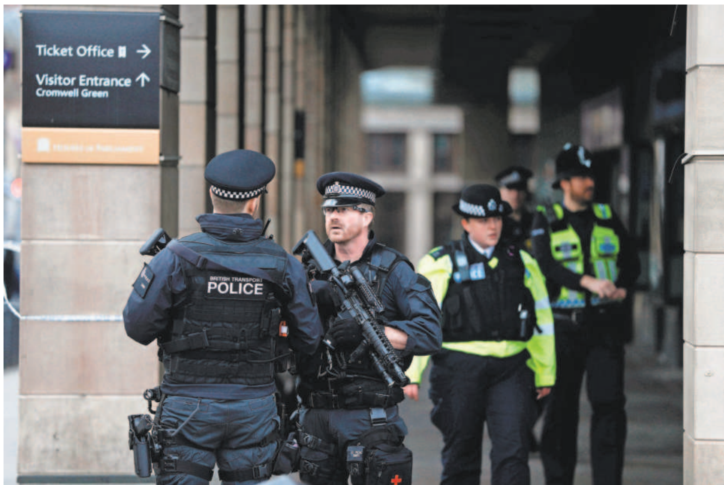
Police secure the area near the Houses of Parliament in London on March 23, 2017, after a terrorist attack.

This "annual terrorism murder rate" is based on the number of fatalities from terrorism beginning in 1975 to June 2017 and is heavily skewed by the 3,000 people killed during the 9/11 attacks in New