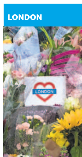
LONDON Eight people were killed in the attack on June 3, 2017, on London Bridge.

It often doesn't feel that way when attacks arouse so much fear, grief