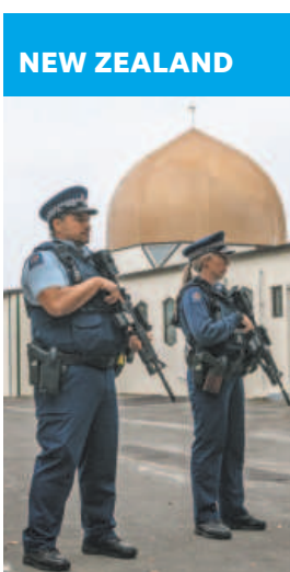
NEW ZEALAND Fifty-one people were killed in March at two Christchurch mosques. Dozens were injured.