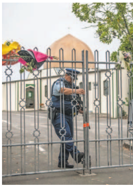
An armed police officer safeguards the Al Noor mosque, which reopened March 23 after a terrorist attack in Christchurch, New Zealand.